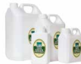
Odour Eliminator 500ml RTU 1 litre Conc. 2.5 litre Conc. 5 litre Conc.

Completely natural, organic and safe to use in any situation where problem odours occur. Absorbs and neutralises the bacteria causing the smell and organic waste material, permanently removing the problem rather than masking it.